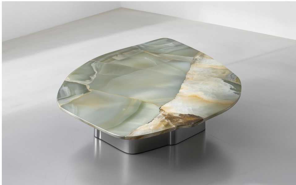
images 1 - 3 — Green Onyx, Brushed Aluminum Legs Organic round shape

Celebrating nature's inherent beauty, the Oni Coffee Table embraces the irregular shape of a found Green Onyx slab. This table's innovative design is informed by the unique constraints of the stone, resulting in a mesmerizing organic forms. The Green Onyx top is elegantly supported by a brush-finished hand-waxed aluminum base and playfully asymmetric legs that explore harmony and balance through proportions.